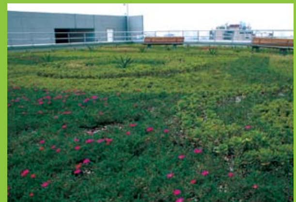
A TREATMENT PLANT to capture rainwater and drainage from bathroom sinks for reuse in its air conditioners.

And yet the contrast of having a green building in a city noted for a lack of environmental consciousness is apparent, as in the garage where a single bike was locked up in an area designed for hundreds. Asked about this, Mr. Tanco smiles. "A little at a time."