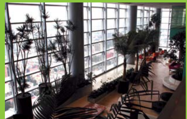
THE BUILDING has motion sensors that turn off lights in conference rooms