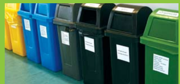
WILL BE THE FIRST OFFICE BUILDING in Latin America to receive the certification of the U.S. Green Building Council.